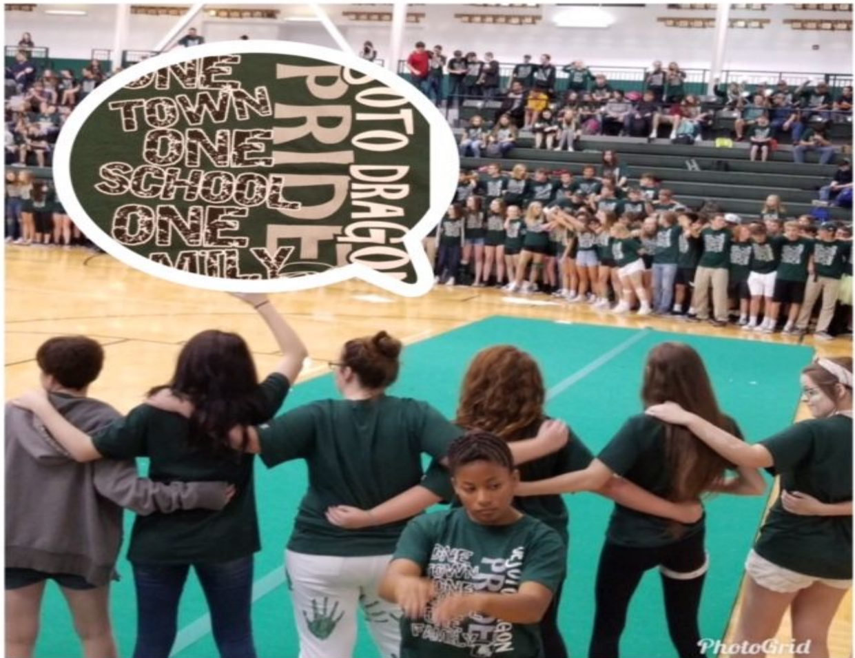
DHS Students Showing Their Spirit

The Dragon Update is a periodic update from De Soto High School. It will focus on current and upcoming events, as well as important dates for DHS families. Additionally, the Update will spotlight some of the great things happening in our building and also give you a closer look at some of our staff members.